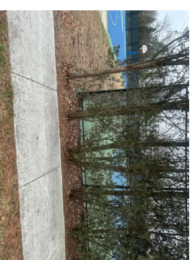
Proposed Corner Gate Location Photo 2