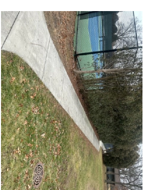
Proposed Corner Gate Location Photo 1