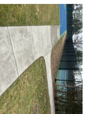
Proposed Corner Gate Location Photo 3

PROJECT TITLE: 2023 Cunniff Park Pickleball Courts Fencing Improvements Project