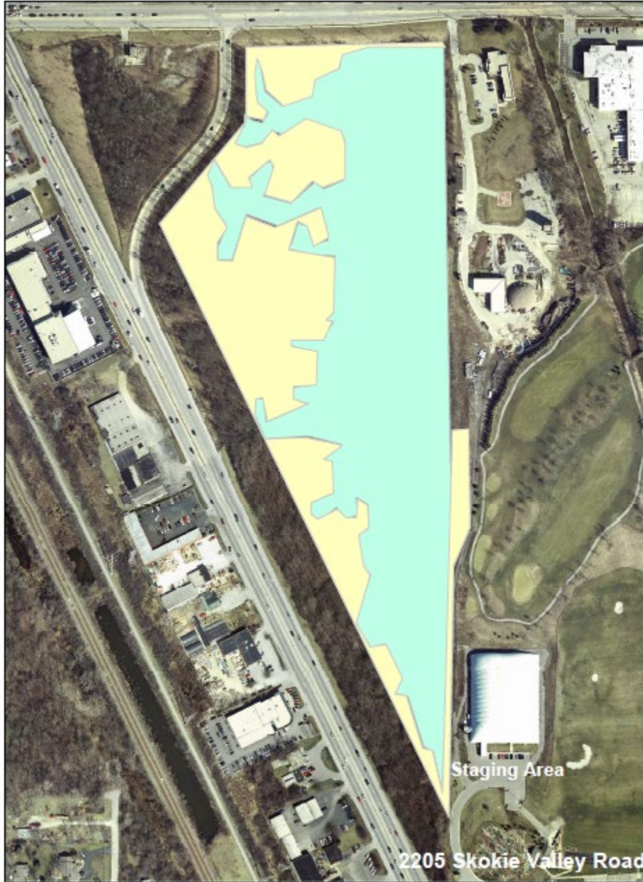
Exhibit A: 2022 Skokie River Woods Invasive Species Management